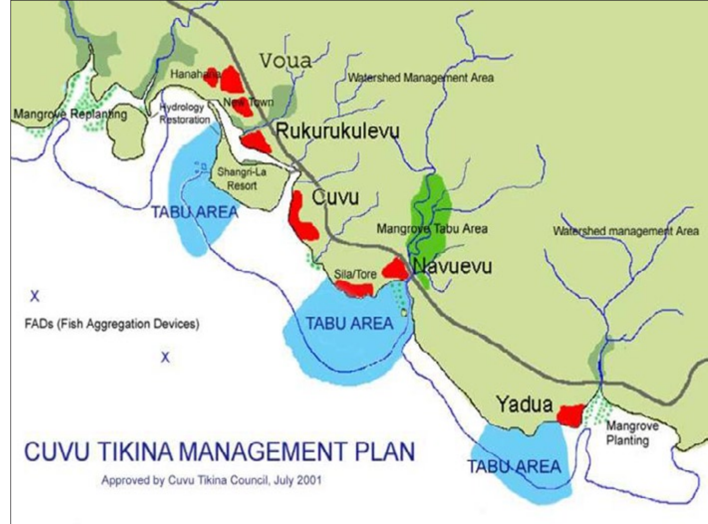
Establishment of community-supported Marine Protected Areas on Fiji