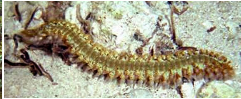
Weeding of seaweeds and removal of coral-killing snails and fire worms