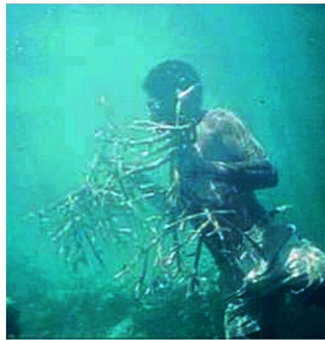
Replanting corals destroyed by coral harvesting and dynamite fishing Solomon Islands