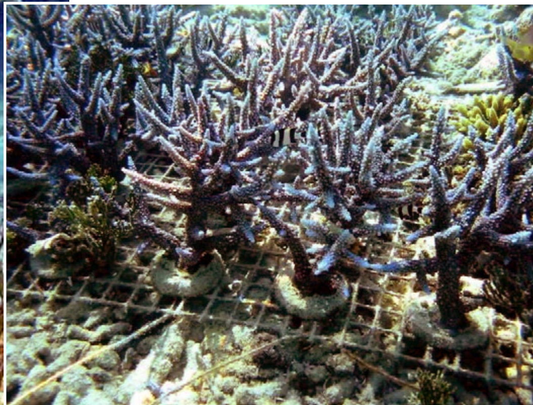
Trays placed directly on rubble