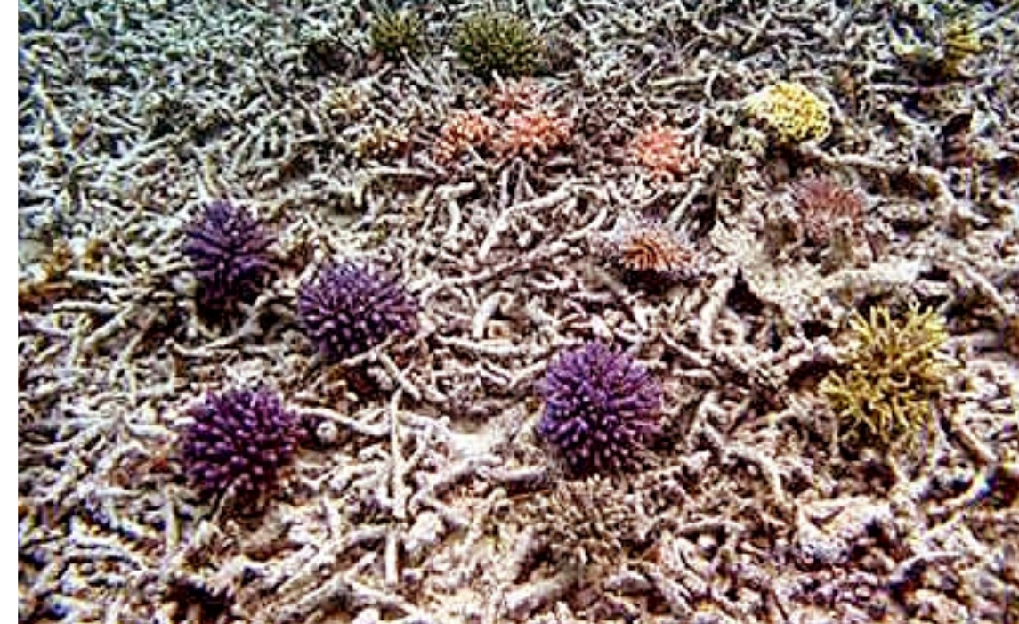
Caribbean staghorn corals like to be planted upright only!