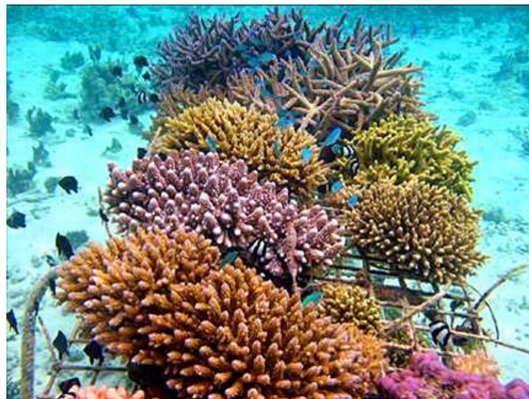
Colonies crowd each other on the table if not trimmed often enough