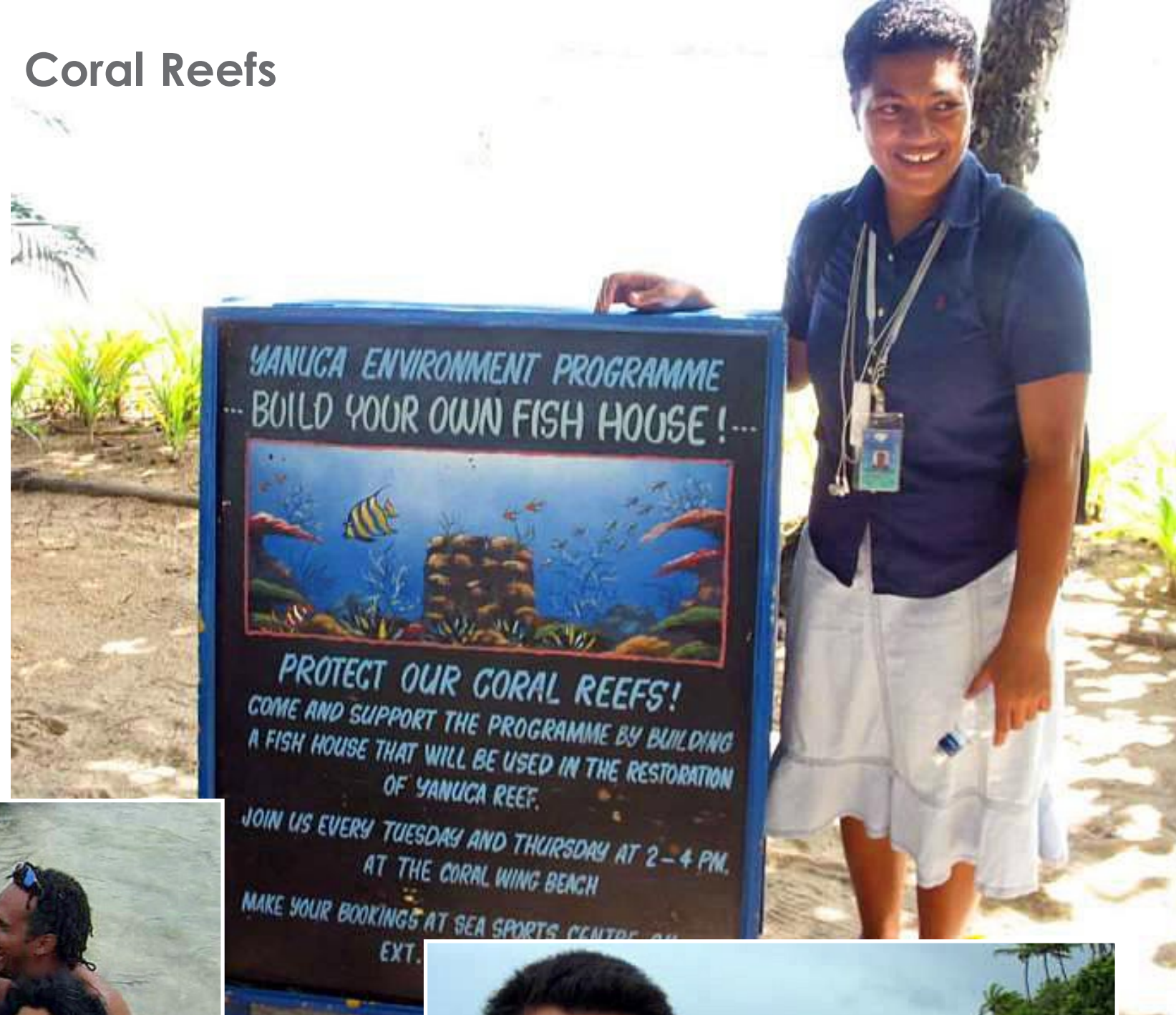
Coral Gardeners: A new profession for resorts?