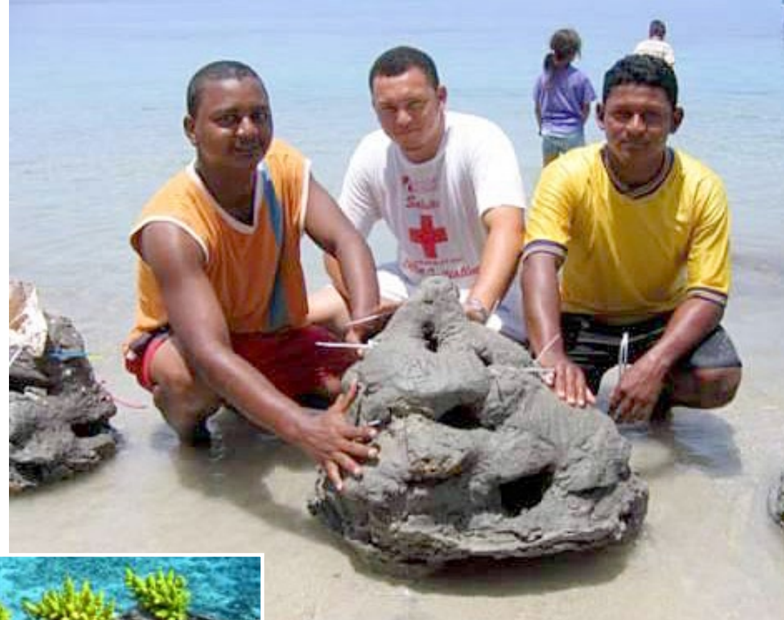
Hands-on Involvement of the Youth Sons of Fishermen Making Fish Houses, Honduras 2005

Corals Planted on Fish Houses For awareness, reef conservation, enhanced guest experience, and community employment!