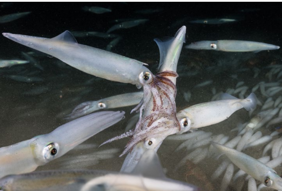
THIS PAGE: In the mating aggregation, male squid lunge after female squid—often three or four per female. The male's tentacles turn crimson red when it has successfully paired with a female, in order to warn other males to stay away. A stingray hunts squid in the swarm (right)