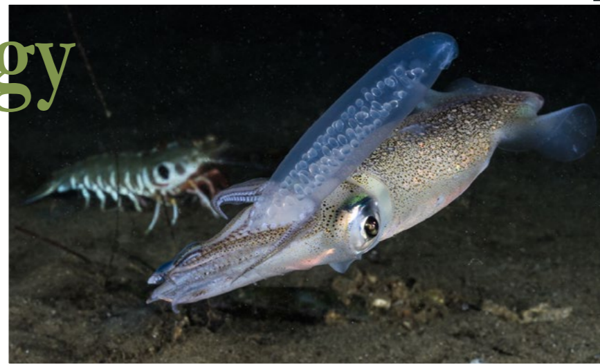
Portrait of a female squid ready to attach her egg case to the substrate