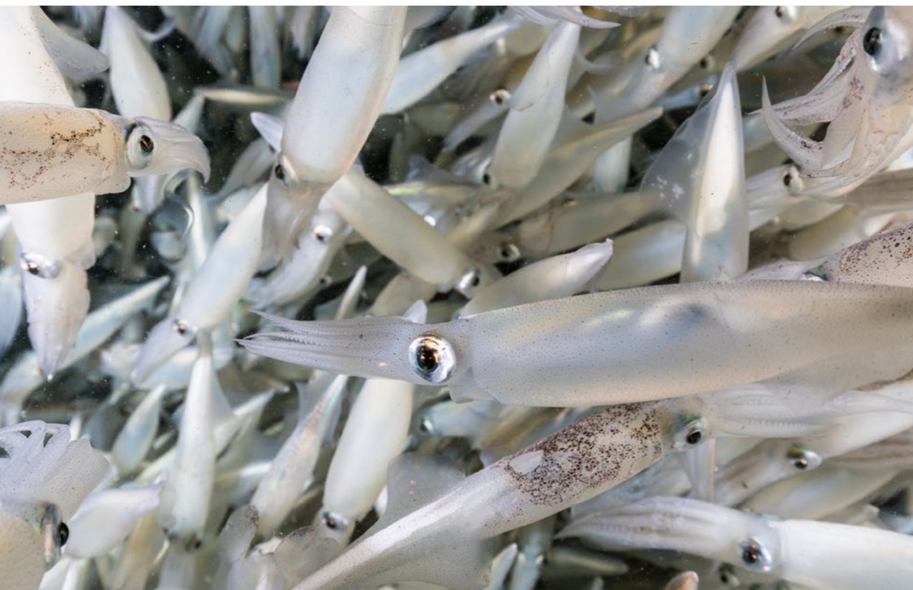
The excitement of the squid run is apparent in the frenzied mating behavior of the species, which is just one of the highlights of this night dive.

Most years, Southern California on the US west coast is the site of a special marine life aggregation, treating locals to one of the most unique dives in the world. Hundreds of thousands of market squid ( Doryteuthis opalescens ) swim into recreational dive depths to mate and lay an expansive canvas of egg baskets (collections of eggs) across the sandy substrate. Because so many squid can be present, and because they are attracted to divers' torches, the dive is spent immersed in a cloud of these small, excited squid.