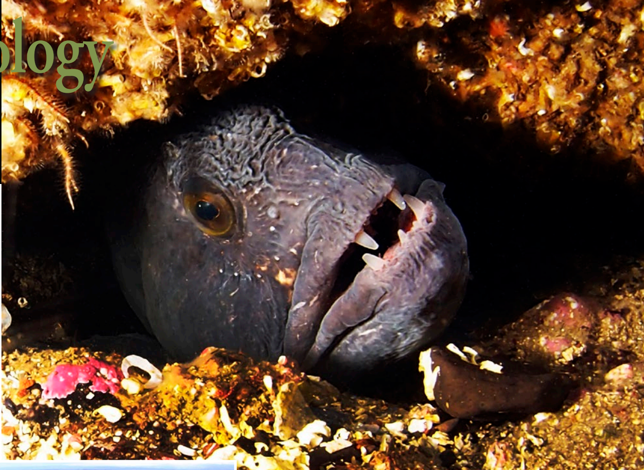
Wolffish, Anarhichas lupus (right); Spotted wolffish, Anarhichas minor , Nova Scotia, Canada (top far right); St Abbs Head National Nature Reserve in Scotland, UK (below); Juvenile spotted wolffish (centre)