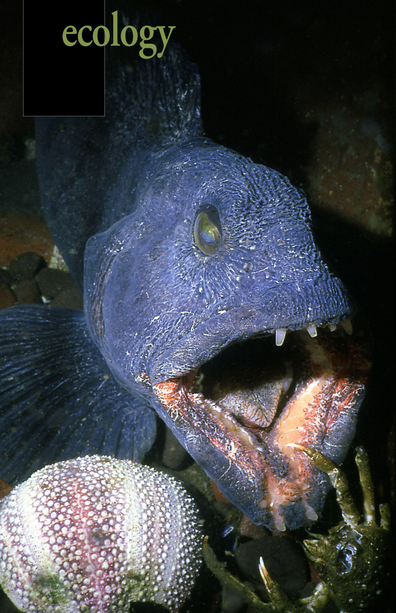
Wolffish in Scotland