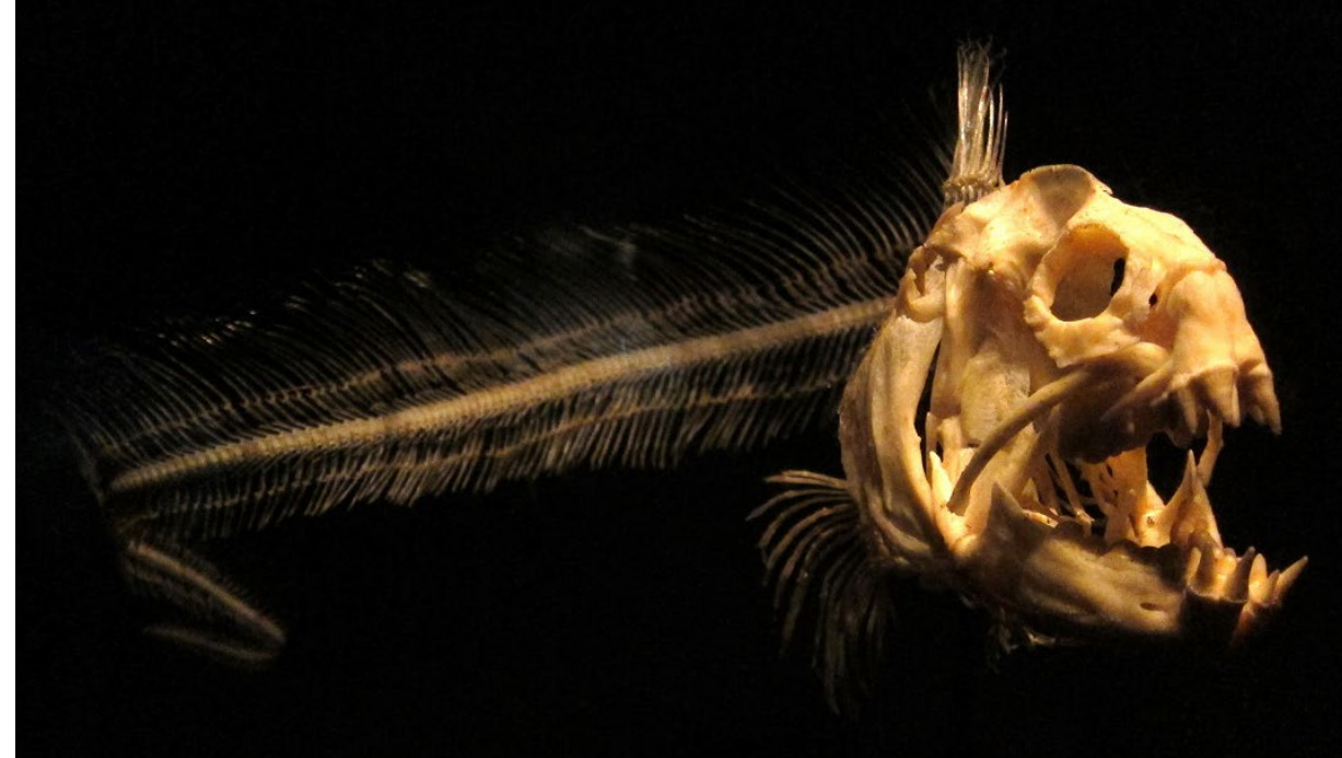
Skeleton of wolffish, showing its impressive teeth (above); Wolffish with prey (right)