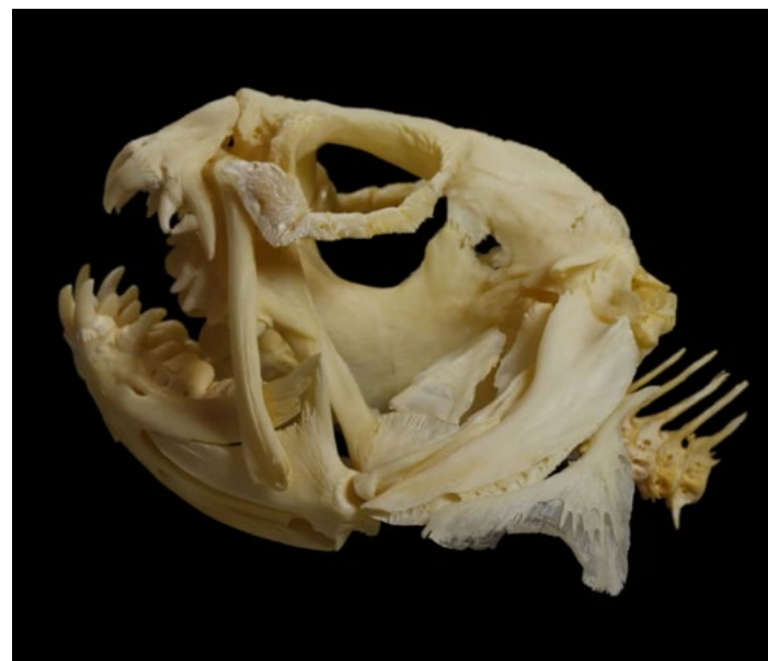
Skull of Atlantic wolffish Anarhichas lupus . Note the complex and impressive teeth (left); Wolf eel pair, Anarrhichthys ocellatus , Vancouver Island (right)

off Tyneside and the Yorkshire Coast (but on a wreck well offshore a few years ago); but the farther south you go down the eastern coast of Britain, the rarer this species becomes as it ventures into warmer waters. However, there are always exceptions to every rule, and