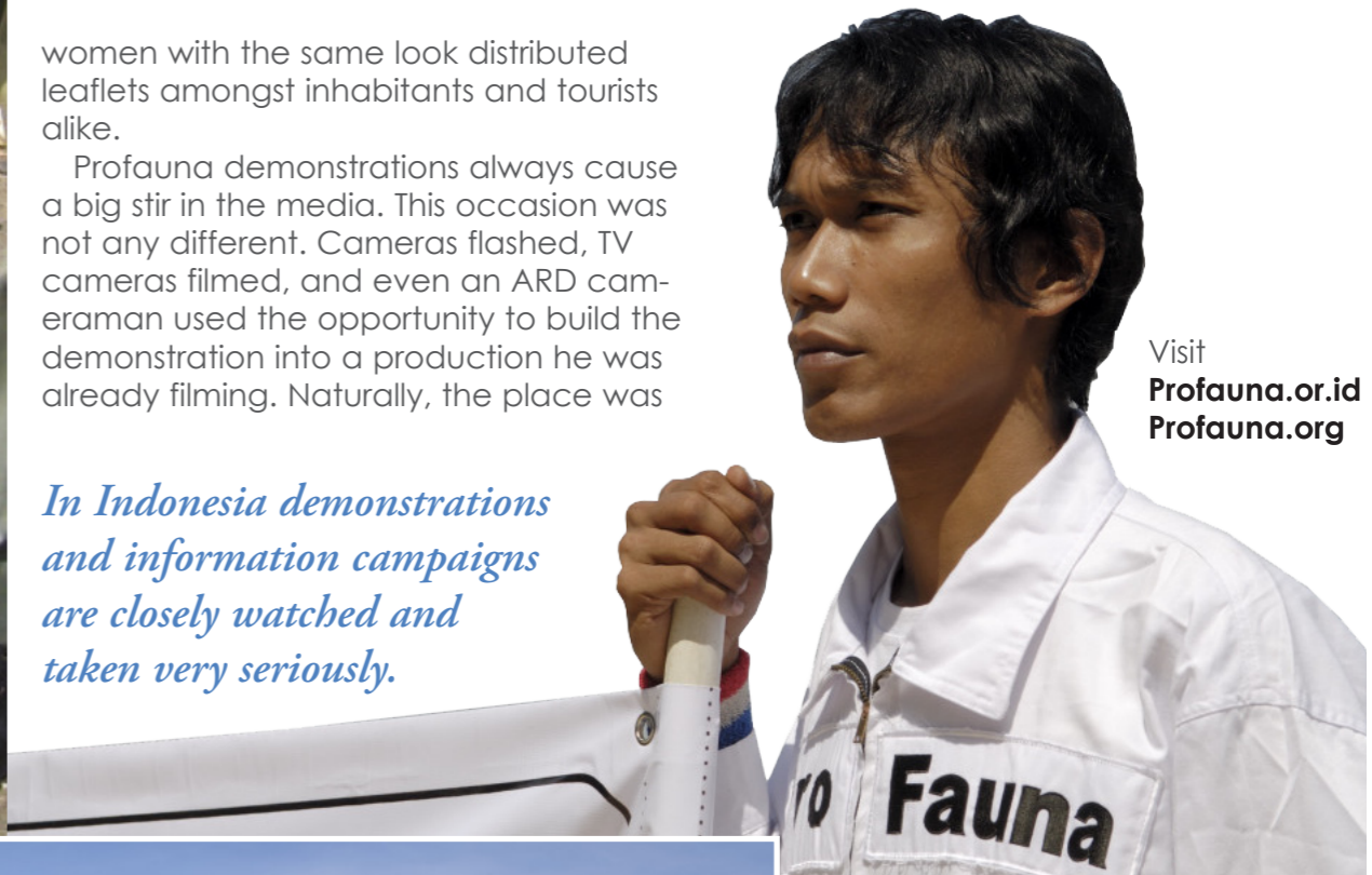
Visit Profauna.or.id Profauna.org

In Indonesia demonstrations and information campaigns are closely watched and taken very seriously.