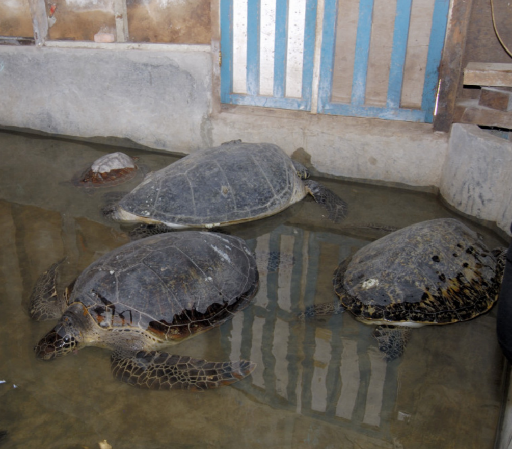
In these squalid conditions the sea turtles were kept before we rescued them