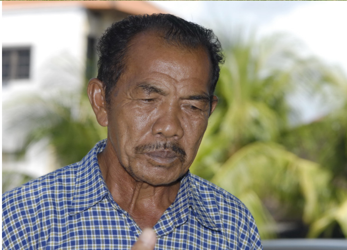
"I still found it challenging to keep my cool when confronted with this man who has, in his lifetime, been responsible for the deaths of hundreds of thousands of sea turtles."

police arrived on site, the animals had already disappeared, and unfortunately, so had the determined tourist.