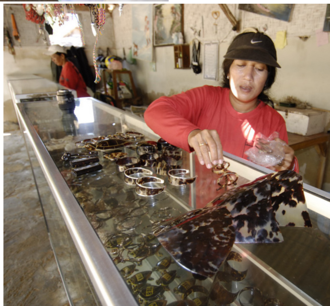
Souvenirs made out of turtle shells are being sold at the "Turtle Island"

Alibi-Island. This "turtle island" is located not far off the