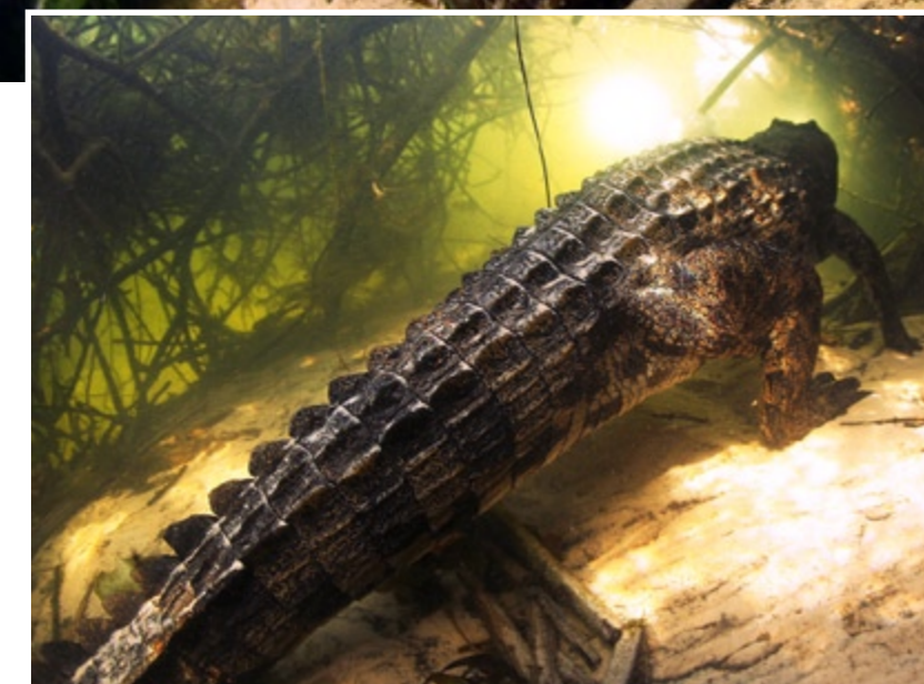
CLOCKWISE FROM LEFT: Rear view of a Nile croc; Croc inspecting underwater filmmaker, Brad Bestelink; Brad and croc in motion; Guide, Richard, with Hawaiian spear encounters croc in the Okavango River

pictures, or shall I help Richard push this croc away?" Before I had to make this 'painful' decision and give up my camera, the croc let go and turned away, but not before it reached the surface and open its jaws wide, for one more fantastic photo opportunity to capture croc behavior.