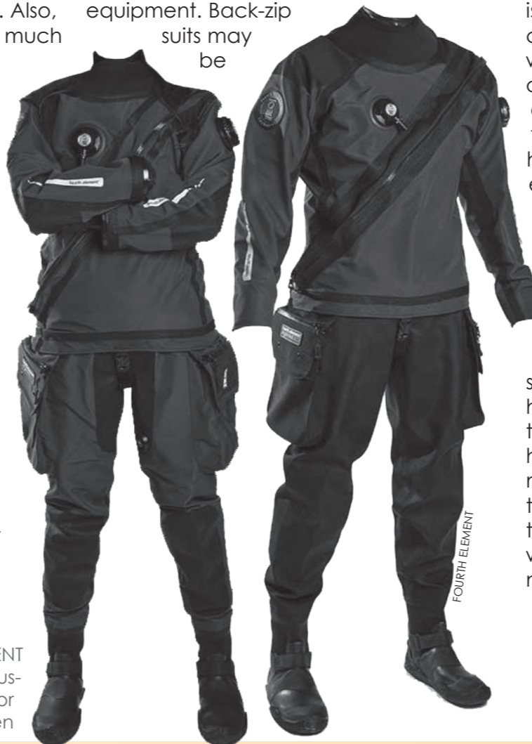
FOURTH ELEMENT Argonaut 2.0 custom drysuit for women and men