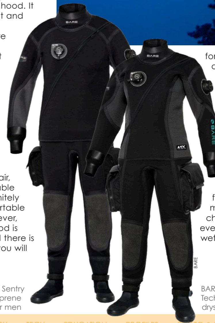
BARE Sentry Tech neoprene drysuit for men