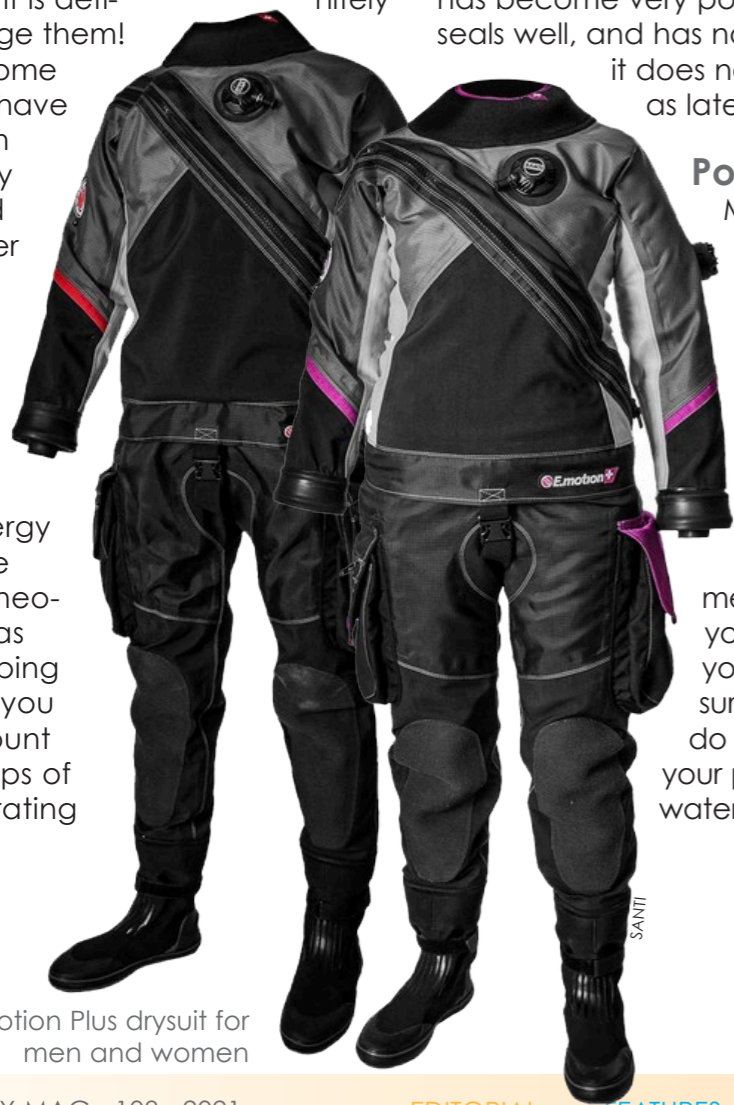
SANTI E.Motion Plus drysuit for men and women