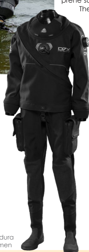
Waterproof D7X Cordura drysuit for women and men