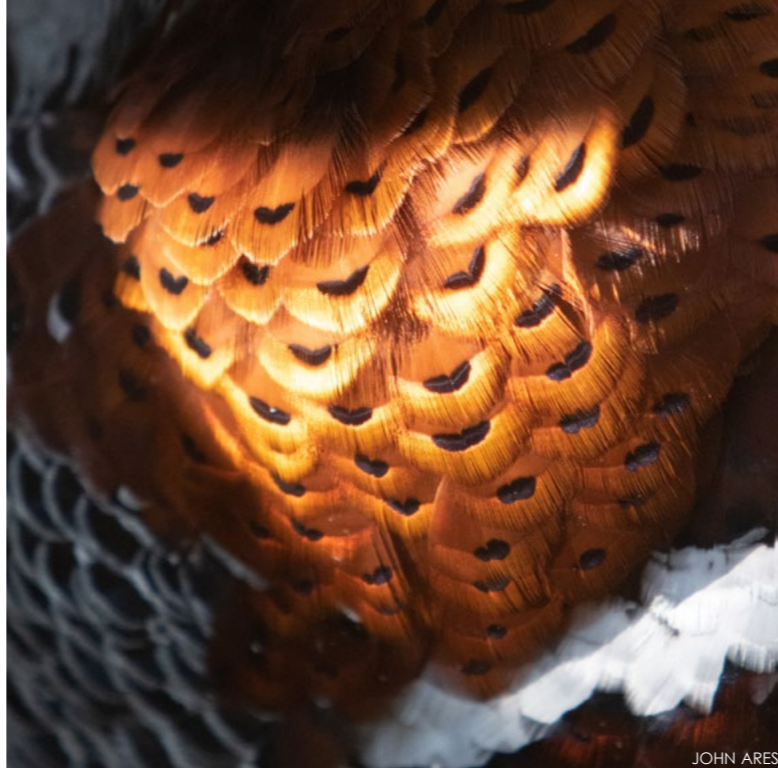
Comparison I. Feathers (right) and Scales (far right), by John Ares. Feathers was taken with a Canon 7D Mk II camera, with 200mm lens. Exposure: ISO 1600, f/3.5, 1/1000s; Scales was taken with a Canon 7D Mk II camera, 600mm lens, Ikelite housing, dual Ikelite DS161 strobes. Exposure: ISO 800, f/6.3, 1/1250s