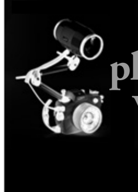
photo & video