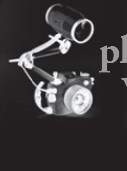
photo & video