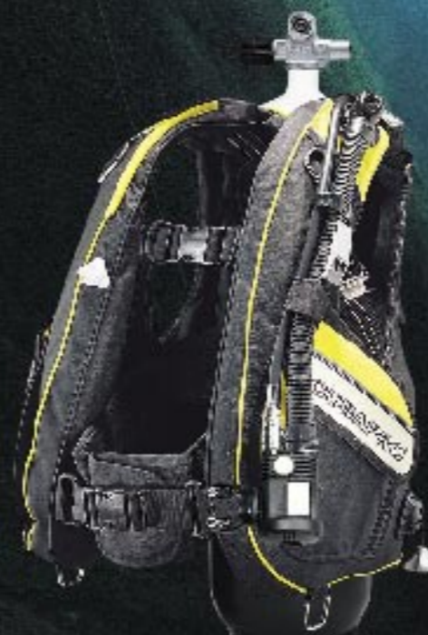
Master Jacket w/ Air II Single Tank and Basic Valve