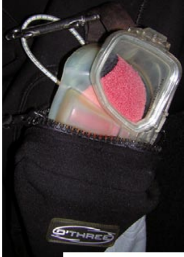
Spare mask can easily be carried in a pocket

If necessary, simulate the problem in shallow water with