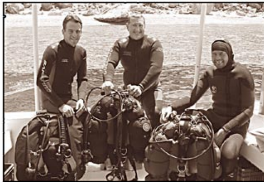
Men in Black?

The down side of multi-gas computers is, they may encourage technical divers to rely on the ability to make new plans on the fly (during the dive), instead of making a structured depth and time plan before the dive. In spite of the risk of being considered old fashioned, I think it is safer to make a structured plan and do the required calculations using an appropriate decompression software before the dive, and consider the deco schedule, as generated by the multi-gas computer, as a bail out option.