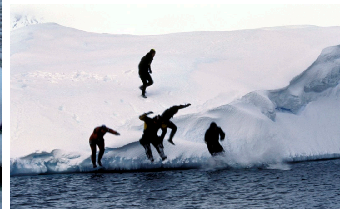
LEFT TO RIGHT: Snow on the deck of the ship; The rugged ice and awesome scenery of Antarctica; What in the world are they thinking?

world. The station is snowed in for about eight months of the year and only receives 250 days of snowfall and barely 800 hours of sunshine—i.e. about 70 days in a year! I am sure he is glad that it's only a 13-month posting.