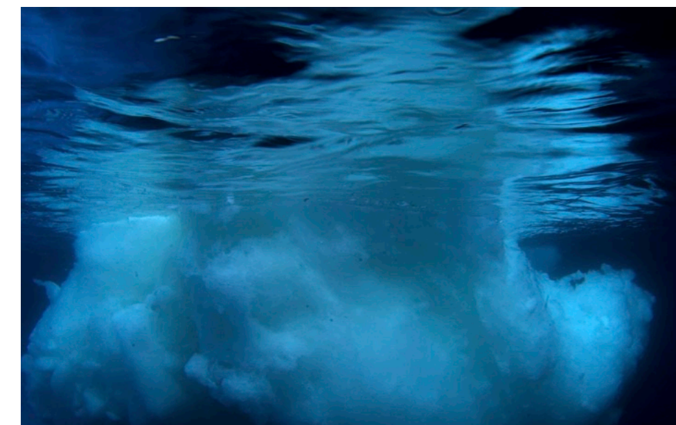
Views of icebergs from under and over the water's surface