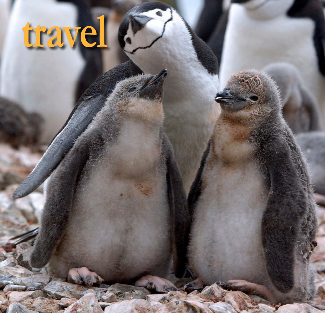
Family of Chinstrap Penguin ( Pygoscelis antarcticus )

Adelie penguin feeds youngster; Spreading their wings at the bottom of the world (below) NEXT PAGE: Chinstrap penguins climb up huge hill to reach their nesting sites