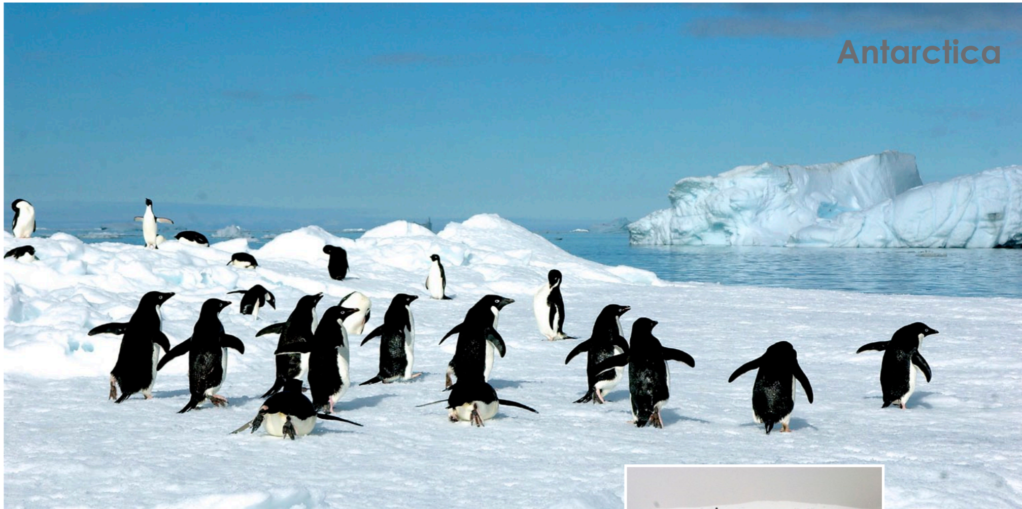
Penguins head to the water to feed; Expedition members spent the night in sleeping bags on solid ice; Chinstrap penguins keep close bonds with their young

The mere mention of Antarctica triggers the imagination and evokes stunning images of a majestic frozen continent laden with resident penguins, polar bears and whales. In the real world, there are no polar bears in the Antarctic, and there are no penguins in the north Arctic. Though both the Antarctic and Arctic are high latitude, freezing polar regions, the similarities end there. The enormous Antarctic is an un-colonized continent covered with ice, whereby the north Arctic is comprised of a frozen ocean at the North Pole, surrounded by land masses to the south of which some are heavily populated by humans.