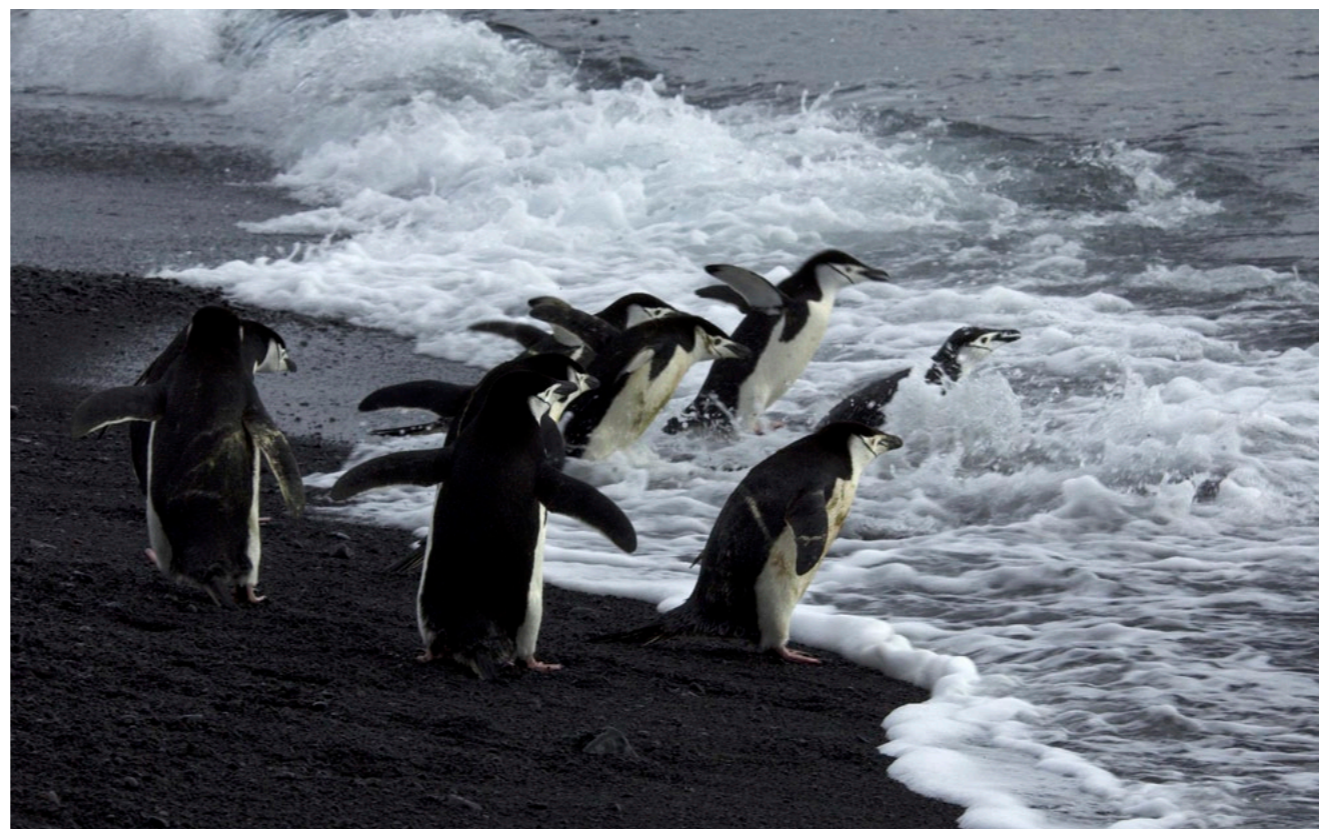
Chinstrap penguins (below) battle the the surf on their way feed on fish, squid and krill up to 50 miles off shore. RIGHT: Map of Antarctica