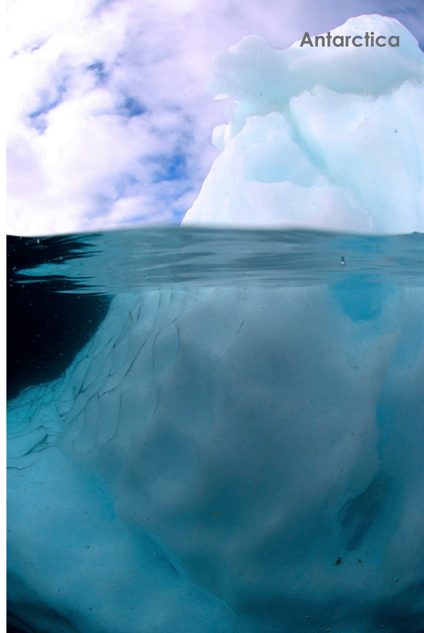
THIS PAGE: Ice! Views of the ice structures and icebergs of Antarctica

intrusion; they happily go about squawking away and doing little penguin chores, from inflating their chest and pointing beaks towards the sky, letting loose a huge lunch-whistle call to mates, to rearranging pebbly rocks for a brand new nest. Whilst we respectfully stayed at a distance, at most times, it's the birds that approached us so close that we could smell their fishy breath.