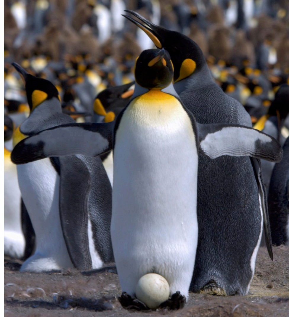
THIS PAGE: Scenes from colony life of the Emperor penguins ( Aptenodytes forsteri )

cold. But as I am writing this back home over a cold Australian winter, how I wish I was born a penguin.