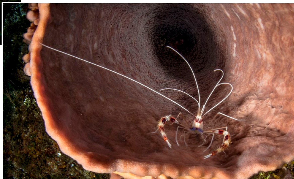
Banded coral shrimp in barrel sponge

Roatán's diving is diverse. There are wall dives, canyons, caverns, shallow reef dives, wrecks, sharks, dolphins and night dives. The reefs are healthy, with plenty of life, and you'd have to try really hard not to see sharks, turtles or rays on any given dive. Just when I thought I had seen all of Roatán's beauty in reef fish, large sea fans and huge barrel sponges, I realized there was plenty more to see than just reefs.