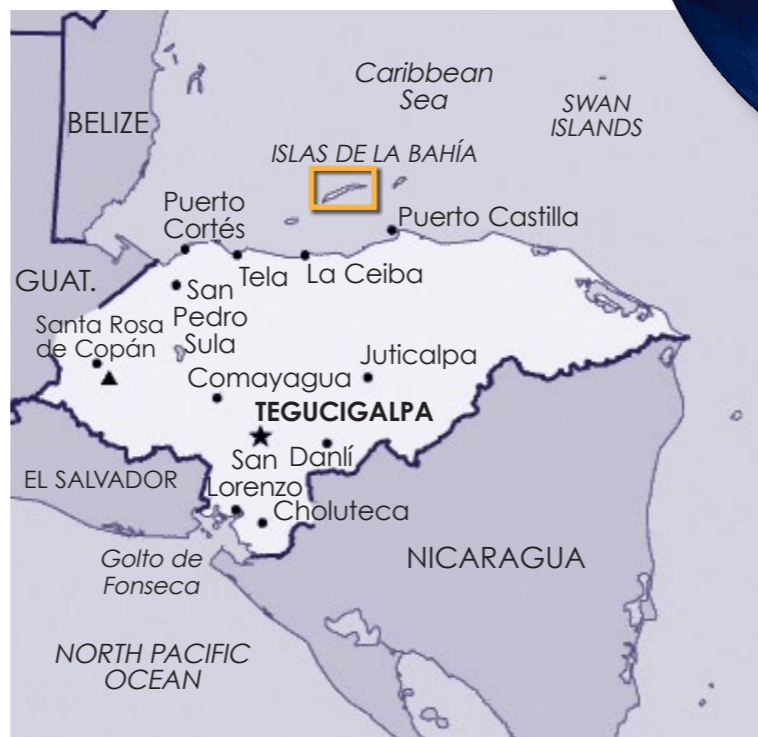
RIGHT: Location of Honduras on global map BELOW: Location of Roatán on map of Honduras BOTTOM LEFT: Queen angelfish BOTTOM RIGHT: Tiny pufferfish peeks out of large sponge

such as apparel, bananas, and coffee, the nation's economy is vulnerable to changes in commodity prices and natural disasters; but, investments in the maquila and non-traditional export sectors are contributing to a gradual diversification of the economy. Almost half of the country's economic activity is directly tied to the United States. In 2006, the US Central America Free Trade Agreement (CAFTA) came into force. It has helped increase investment, however, security and political issues may be deterring potential investors. Marginal economic growth in 2010 will not improve living standards for those in poverty, which is almost 65 percent of the population. The fiscal deficit is growing, despite improvements in tax collections because of