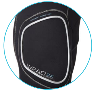
The WPAD™, or the Waterproof Personal Accessory Dock, is a soft artfully constructed docking station located on the right thigh used for attaching our expandable pocket.

The W4 also features double computer strap anchors with anti slip, comfort front neck zipper, inner plush lining, seat and shoulder antislip reinforcement.