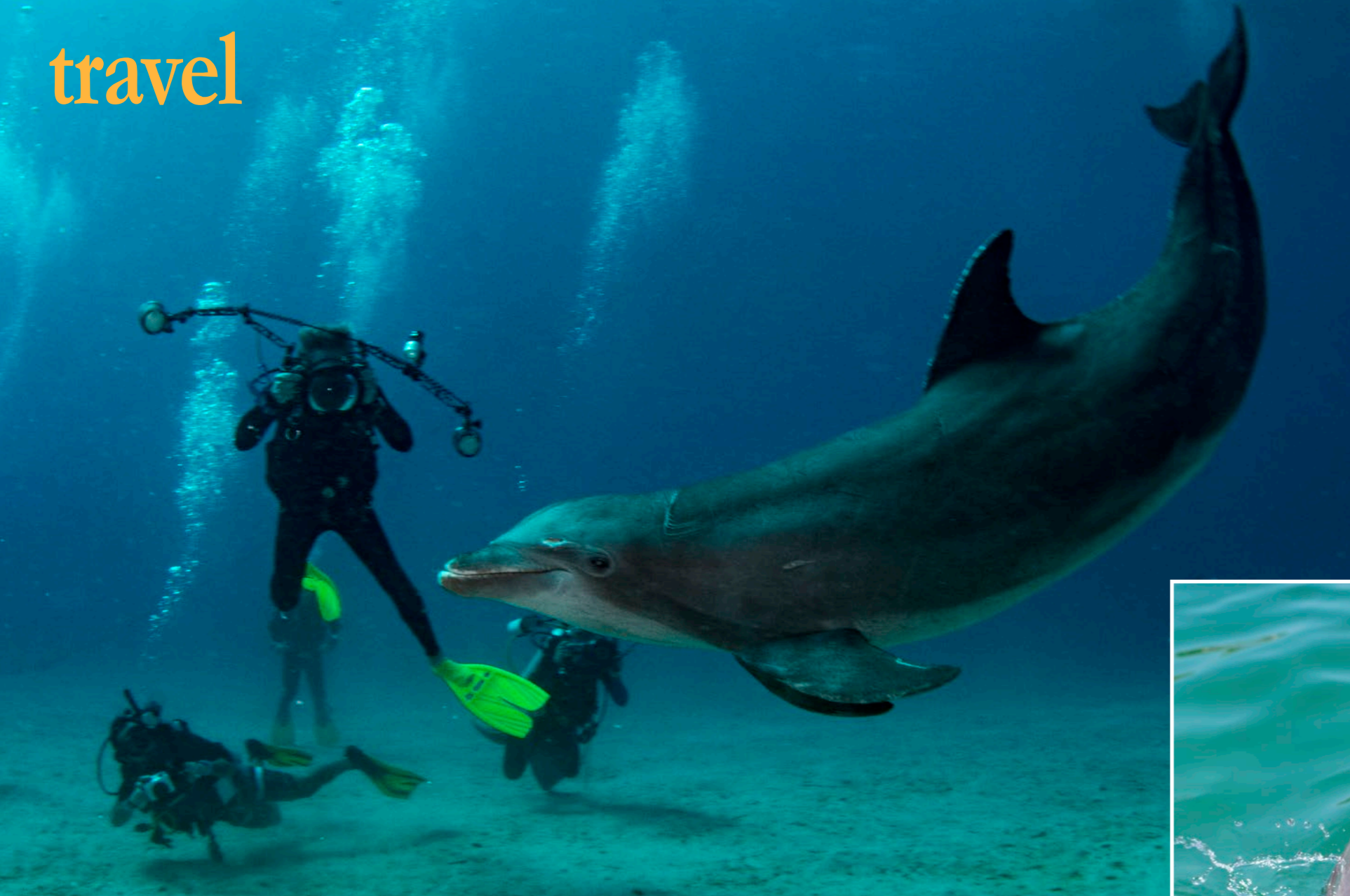
Photographers capture images of bottlenose dolphins on the dolphin dive (left); Bottlenose dolphin at Anthony's Key Resort (below)

many large female grey Caribbean reef sharks showing up daily for the fish snacks the dive shop puts out for them.