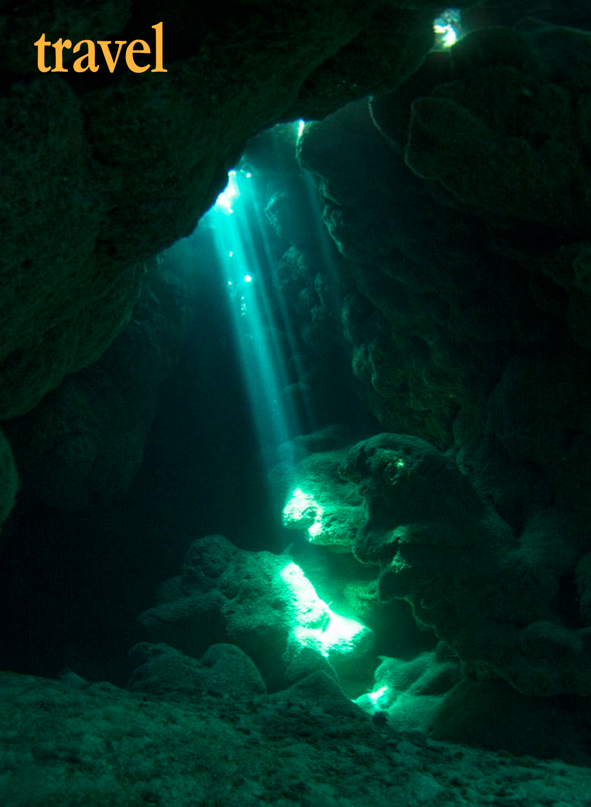
Sunlight pierces the interior of Dolphin's Den