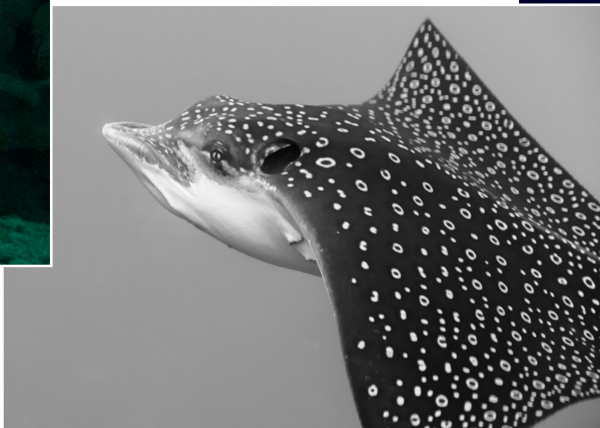
Eagle ray swims by, off a reef ledge

Dolphin's Den. Our second dive was at Dolphin's Den. This amazing site got its name from the skeleton of a dolphin found inside the cavern many years ago. No deeper than 12m (40ft),