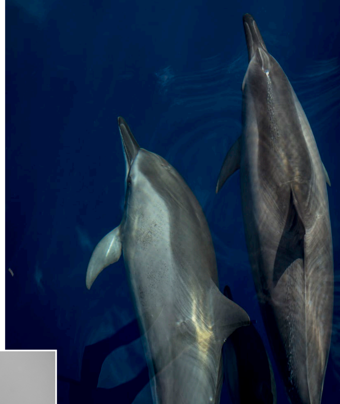
Spinner dolphins swim next to the dive boat

ting close to hurricane season, and although Roatán isn't in the hurricane belt, I was still feeling really lucky with the weather.