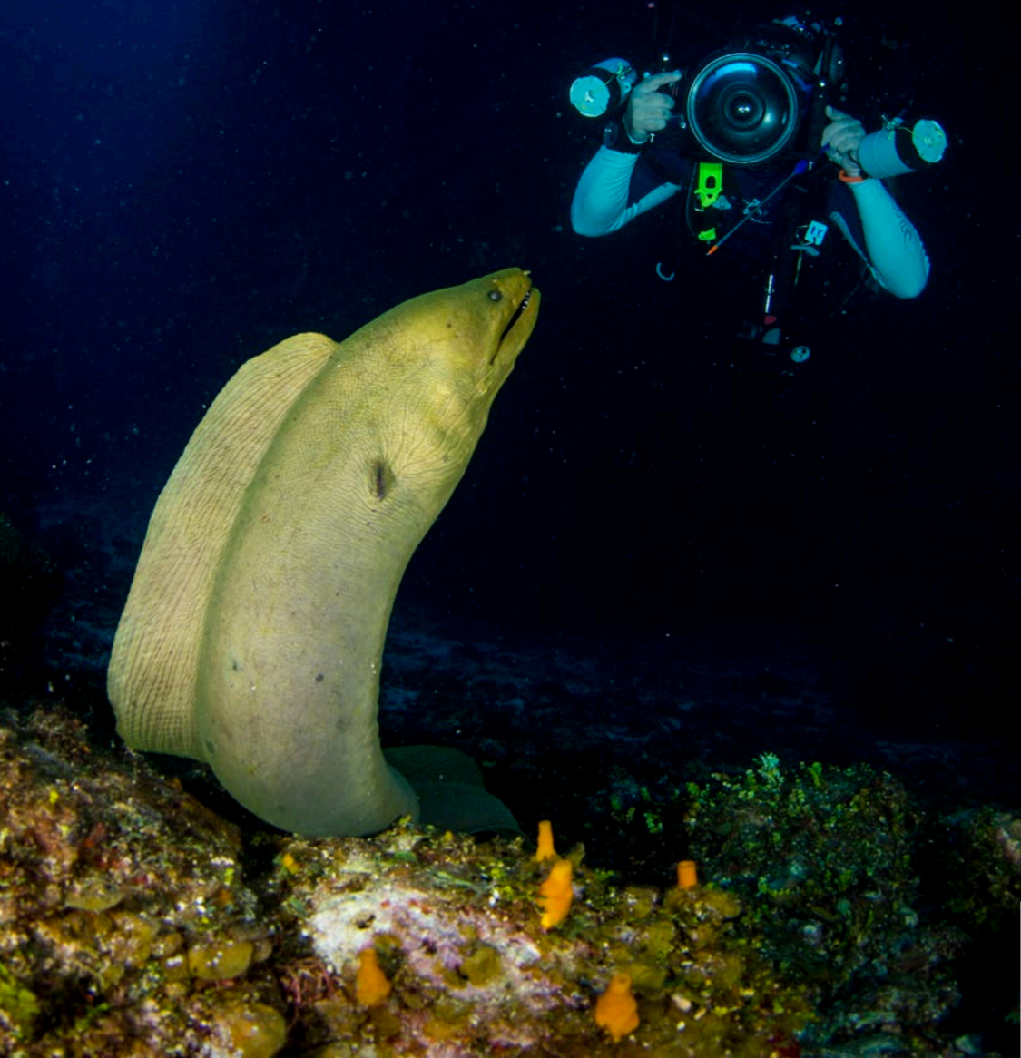
A moray eel poses for a diver's camera (left); Wreck of the El Aguila, an artificially sunk wreck on the northwest side of the island (right)