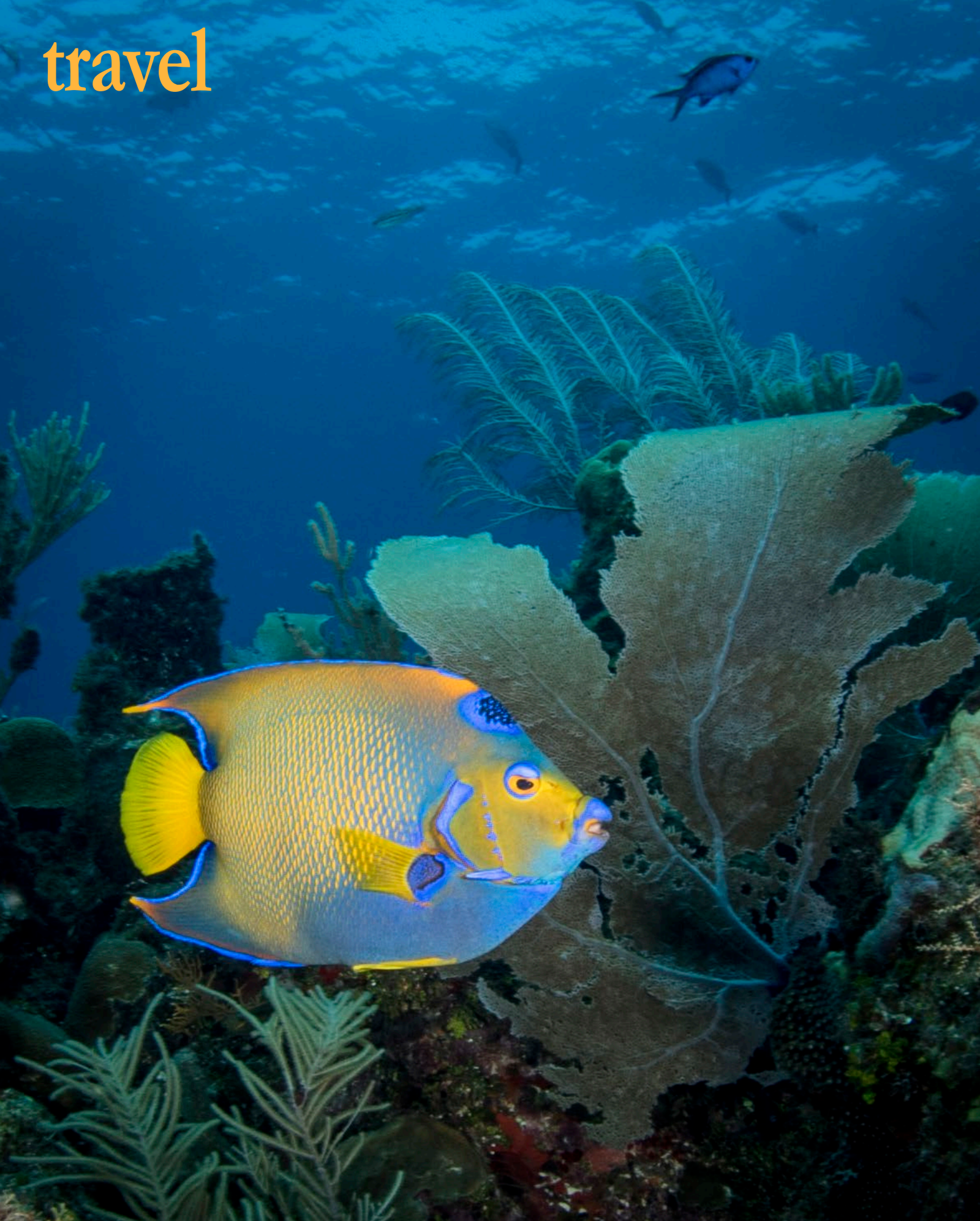
Queen angelfish on reef. PREVIOUS PAGE: Roatán's reefs are colorful and beautiful to photograph