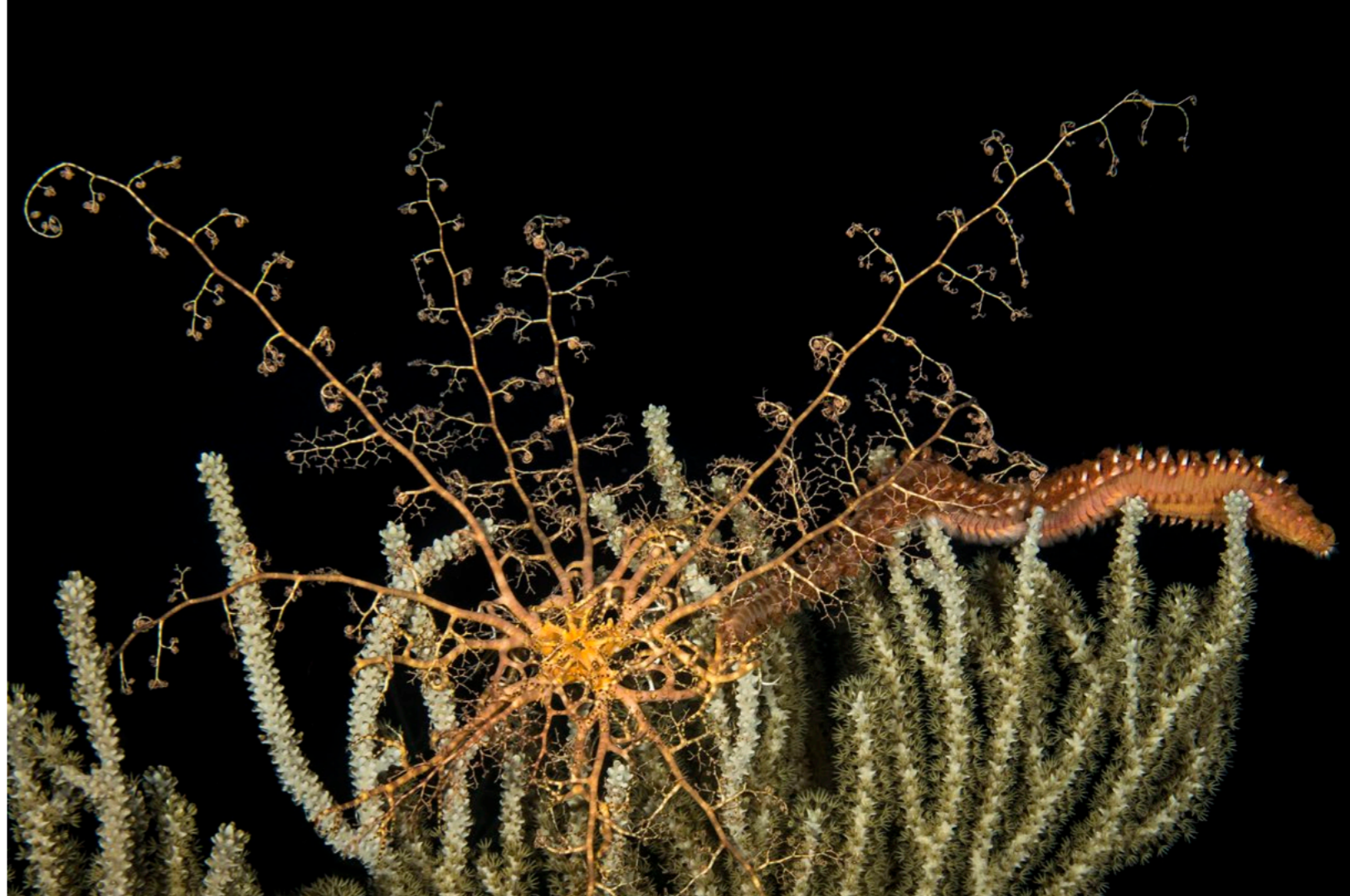
Fire worm with basket star, unfolding in all its glory, found on a night dive

It is 7:30 in the morning and I'm on my personal veranda on a small hill looking out over green trees and beyond them to blue water and a bright orange sun emerging from it. My feet are up on the rail and there's a cup of coffee in my hand. I snap a photo for Instagram—#itdoesntgetanybetterthanthis. And the day's diving hasn't even started yet.