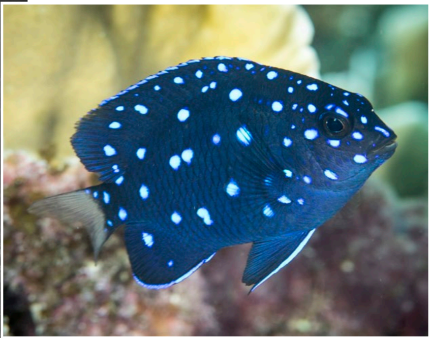
A pretty juvenile damselfish makes a perfect subject on which to practice macro photography (above); Diver swims through crevasse at the popular dive site, Mary's Place (left)

Marine Park has developed a Lionfish Control Program. Their aim is to cull the lionfish, and they have worked together with the Honduran government fishing agencies to educate and