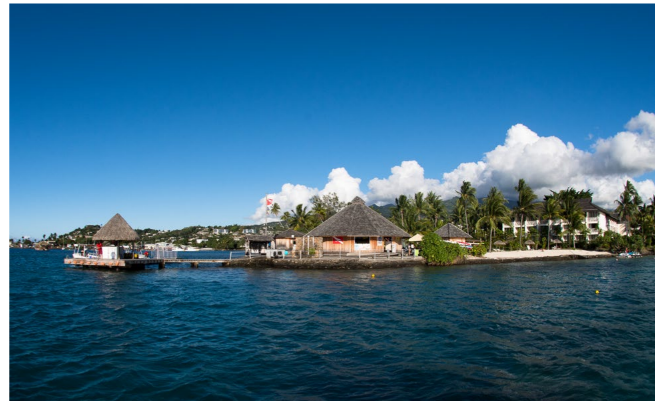
TOPDIVE Tahiti, which is located at the InterContinental Tahiti Resort and Spa, offers humpback whale experiences for divers; In winter, humpback whales migrate all the way from Antarctica, where they feed on krill during the summer months, to the warm waters of Polynesia (top)

French Polynesia is an exceptional destination to observe whales and remains one of the rare places on our planet where it is still legal for a few lucky divers to get in the water with them. To do so, the French Polynesia Ministry of Environment has developed rules that aim to ensure safe and respectful animal encounters. It is crucial for nature enthusiasts visiting these blue Pacific waters between July and October to strictly respect the rules about approaching the animals and when to get in the water.