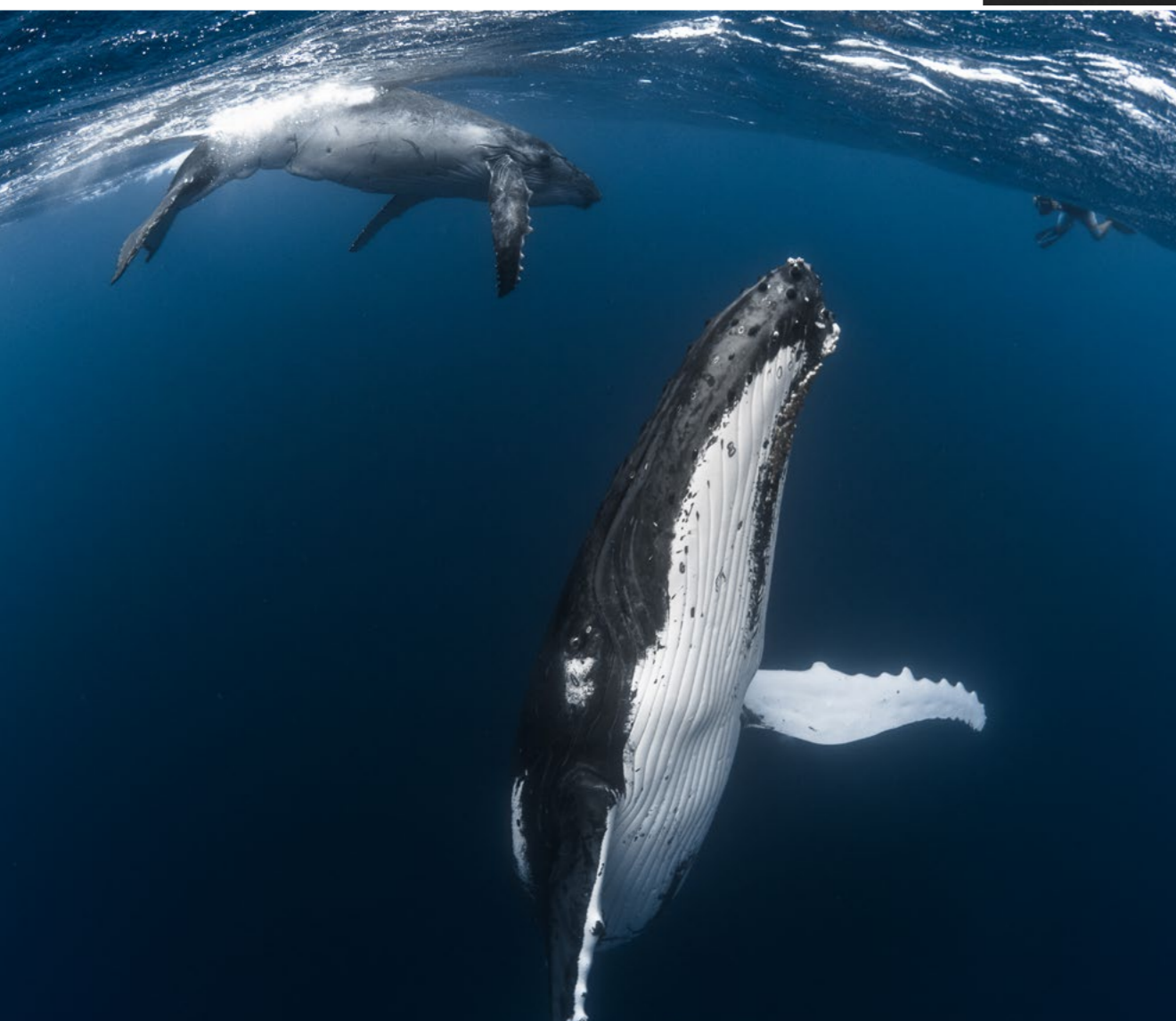
Humpback whale songs are so powerful, they can be felt reverberating through one's body and camera gear; Protective mother and playful calf at the surface (left); Fluke of humpback whale (top left)

After a few minutes, the calf made another trip to the surface. This time, it looked more determined and less hesitant. Under the careful gaze of its mother, who seemed to accept our presence, it came directly towards us. It came close—too close, forcing us to swim aside and splitting our group in two.