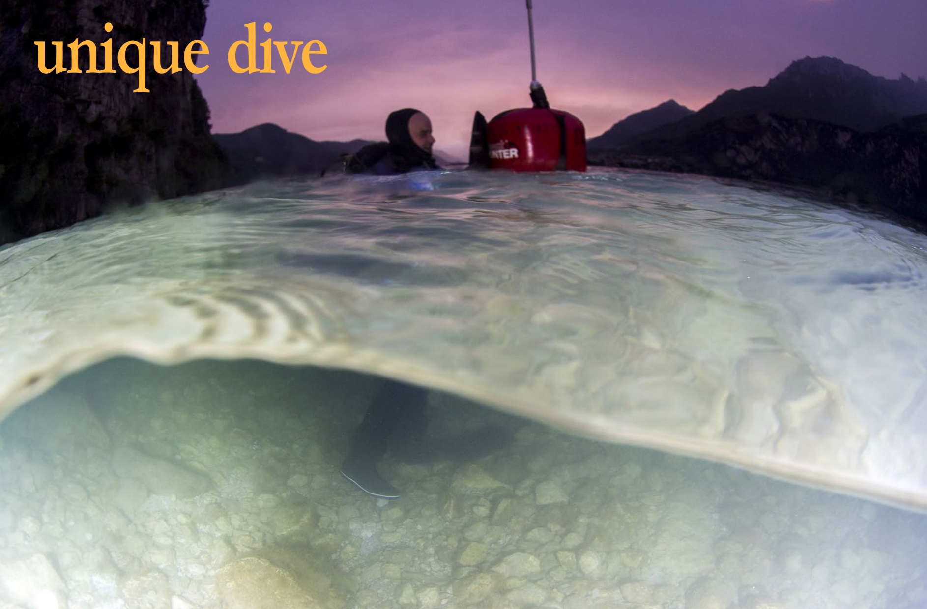
Diver prepares for a dive in Lake Como to see the mysterious machines of Moregallo—submerged car wrecks