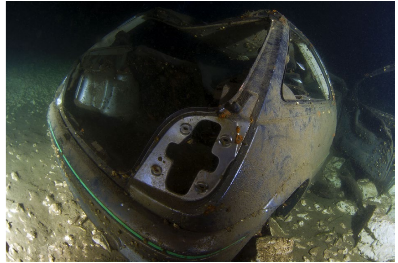
THIS PAGE: Wrecked cars make eerie underwater scenes in Lake Como at Moregallo

“Moregallo sub” to see some of the news headlines, which are, to say the least, disturbing. It is often the case that the headline makes waves, but some journalists unfortunately don’t elicit an effective impact on the public, often at the expense of the facts of the case and respect for the people involved.